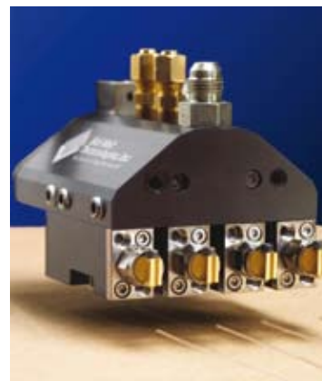
Aimable, Low Profile