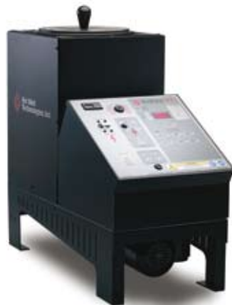
G5-50 AutoPack with a 50-lb melt tank