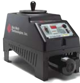
205 AutoPack with a 8-lb. tank