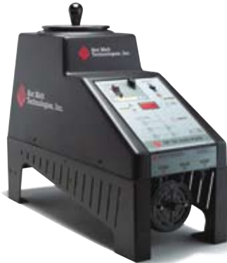
HP-20 AutoPack with a 15-lb. tank