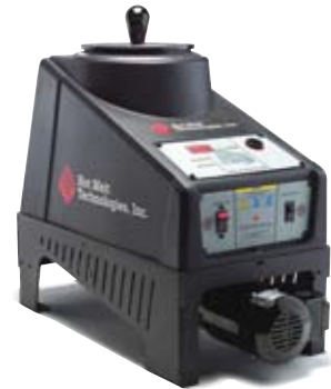
215 AutoPack with a 15-lb. tank