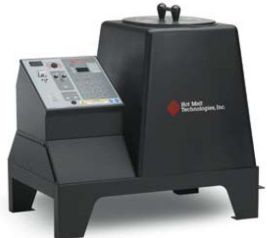
G5-135 Autopack with a 135-lb melt tank