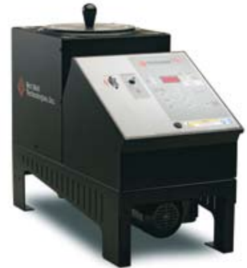
HP-535 AutoPack with a 35-lb. tank